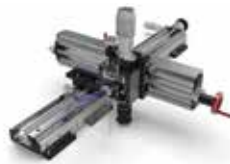
Linear Milling Machines