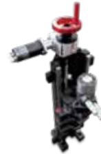
Drilling and Tapping Machines