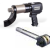
Manual & Pneumatic Torque Multipliers