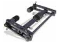
Flange Puller Sets