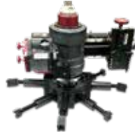
Flange Facing Machines