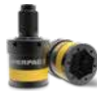
STTL-Series Safe T™ Torque Lock