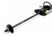
Valve Change-Out Tool Sets