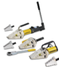
Step-Type Flange Spreaders