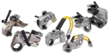
S-, W-, RSL-, DSX-, and HMT-Series Hydraulic Torque Wrenches