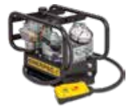
Pneumatic Torque Pumps