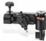
Mechanical Flange Face Tool