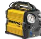
Electric Torque Pumps