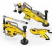
Flange Alignment Tools