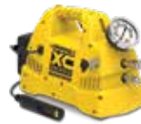
Cordless Torque Pumps