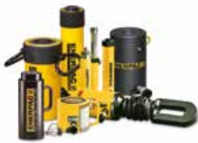
Cylinders & Lifting Products