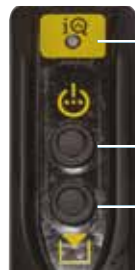
3/2 Jog, 3/2 Dump, 4/3 Jog pendant with 3 metres cord