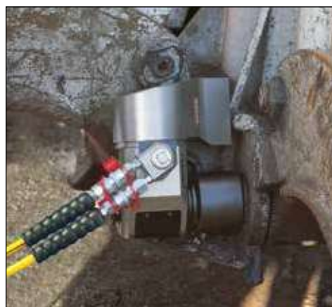
◀ Easy and reliable service in the field using Enerpac SQD-Series torque wrenches.