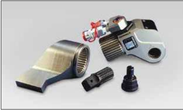
▲ All wrenches come standard with swivel coupler, square drive and reaction arm.

ENERPAC POWERFUL SOLUTIONS. GLOBAL FORCE.